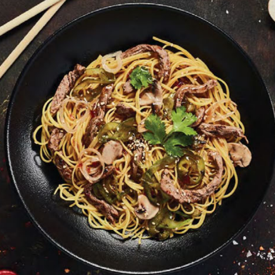
Hong Kong Steak Noodles