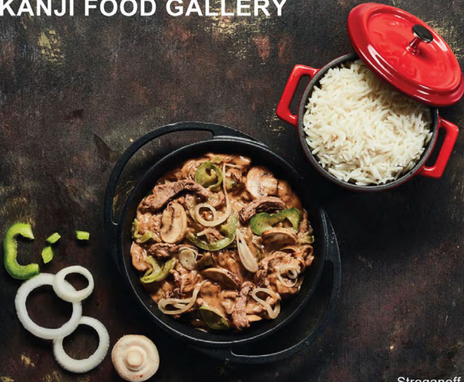
Stroganoff Steak Rice