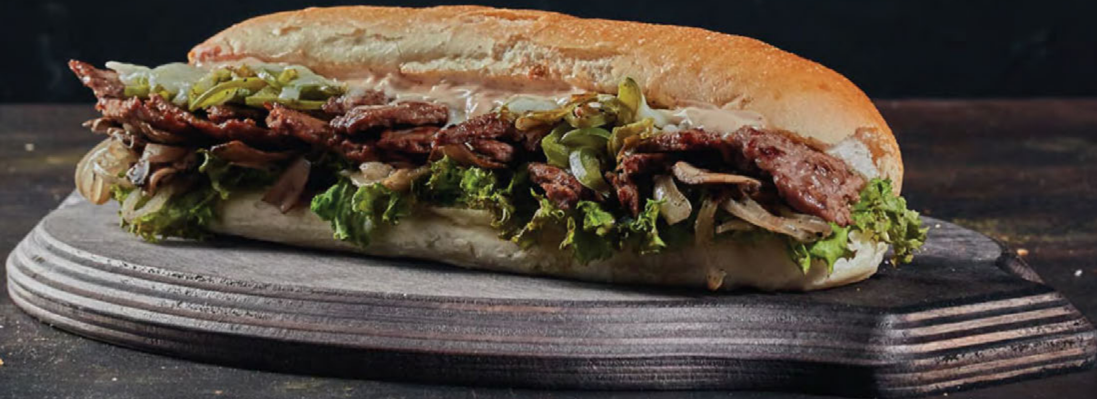
Philly Steak Sandwich