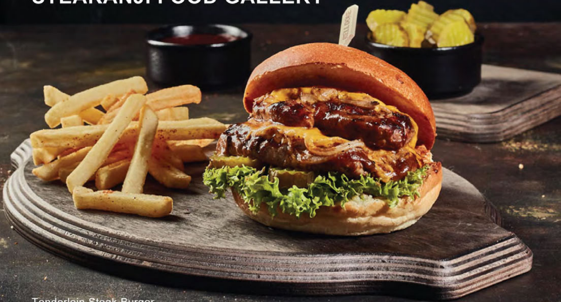
Tenderloin Steak Burger