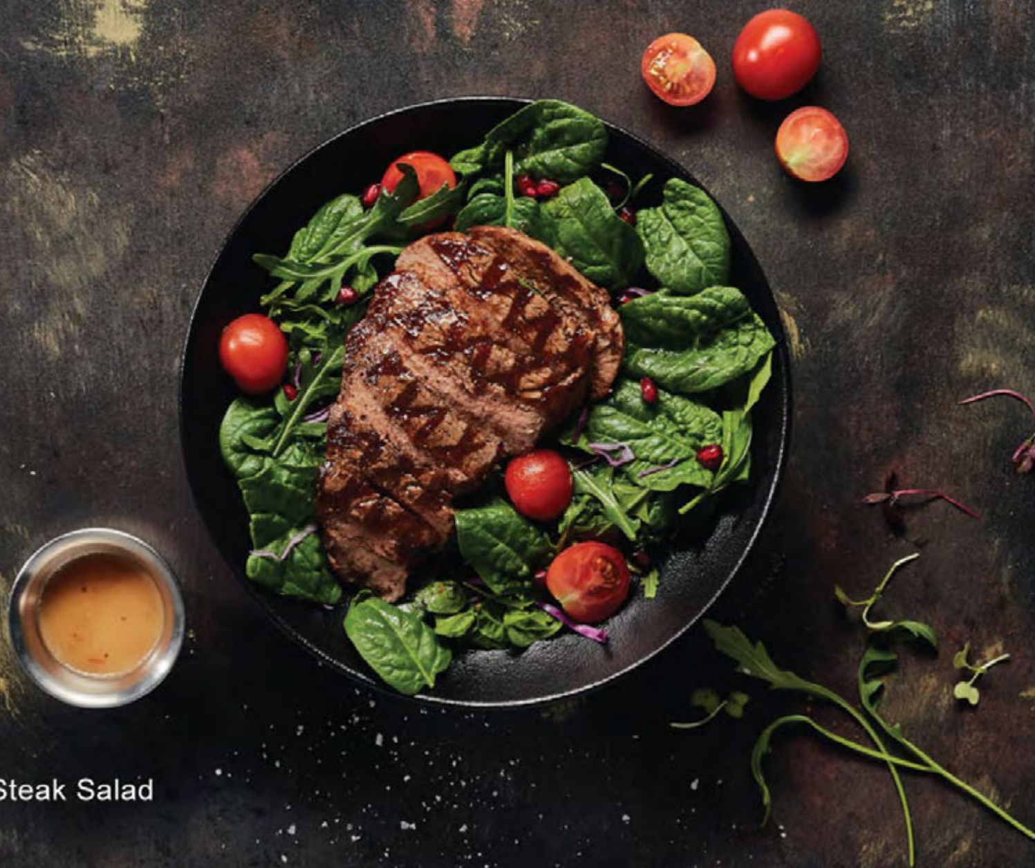
Tenderloin Steak Salad