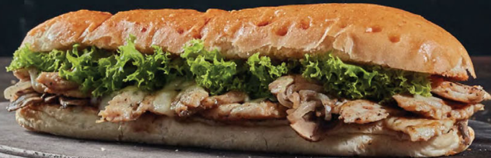
Alfredo Chicken Sandwich